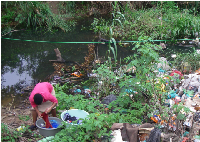
A woman from the Quarry Rd informal settlement washing clothes at the polluted Palmiet Stream – a governance failure